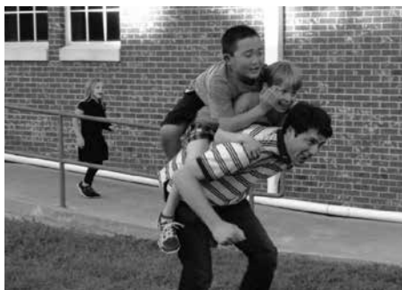
Photos from FOF Family Game Night & Awards